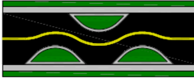
Phase III - Chicane