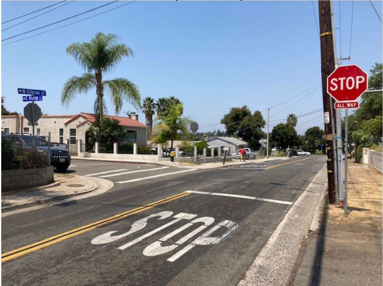
Phase II-A – All-Way Stop