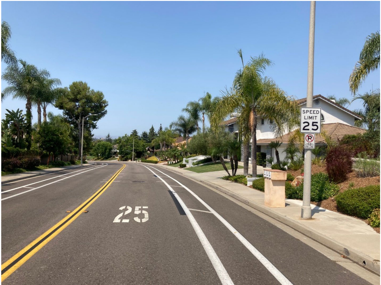
Phase I – Speed Limit Sign and Marking and Lane Narrowing