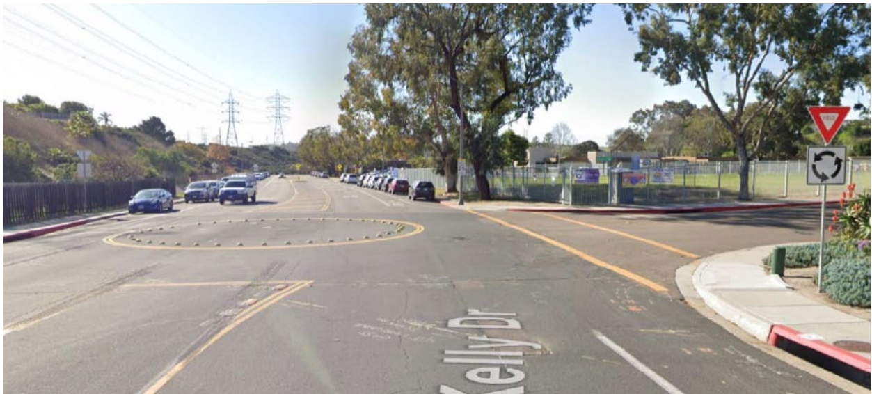
Phase II-B – Horizontal Diversion