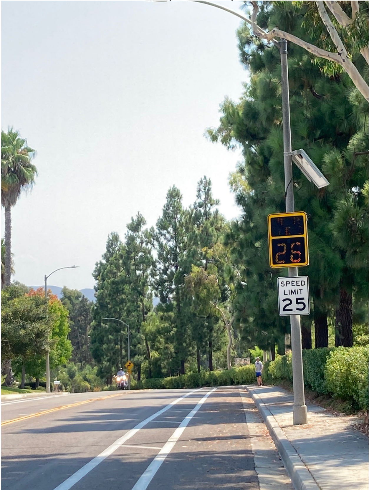
Phase I – Speed Feedback Sign