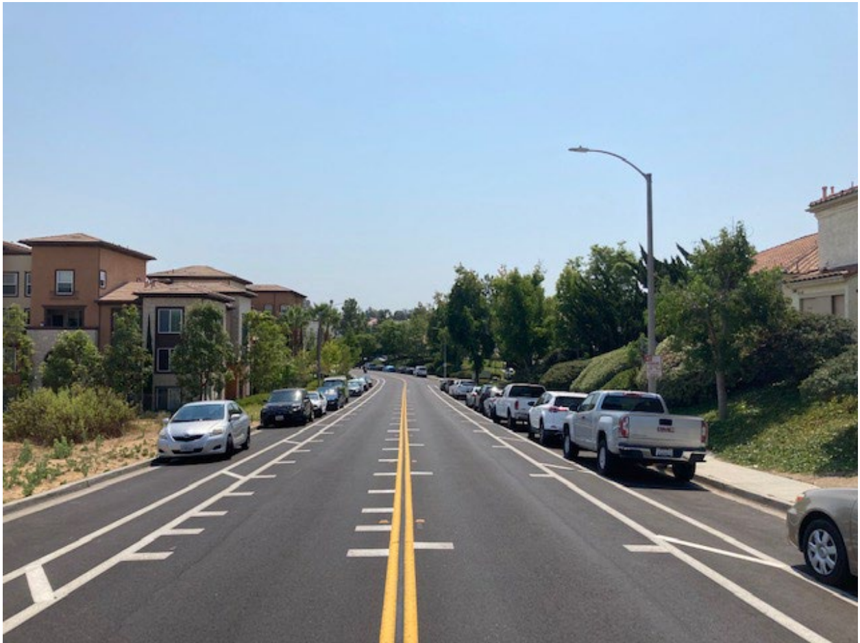
Phase I – Speed Reduction Markings and Parking Lane Buffer