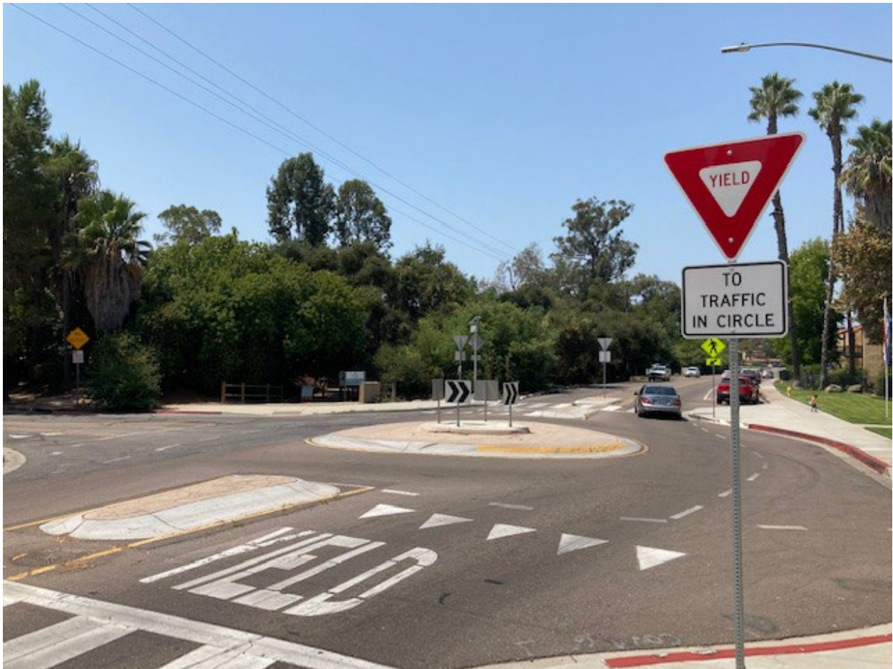
Phase IV - Roundabout