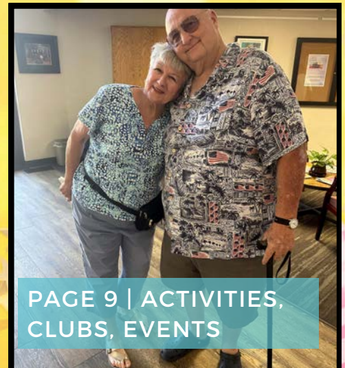
PAGE 9 | ACTIVITIES, CLUBS, EVENTS