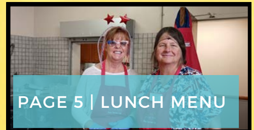
PAGE 5 | LUNCH MENU