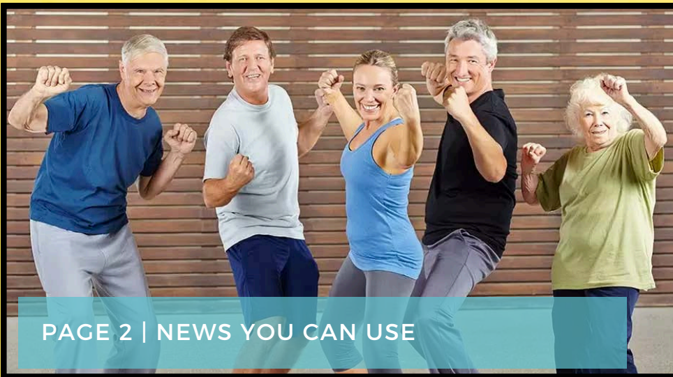
PAGE 2 | NEWS YOU CAN USE