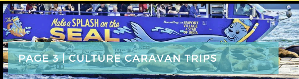
PAGE 3 | CULTURE CARAVAN TRIPS