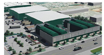
EDCO's Anaerobic Digestion Facility

Organic material discarded in your green organics bin will be sent to an organic waste diversion facility such as a composting or anaerobic digestion facility. In these natural processes, microorganisms break down organic materials such as food waste. Organic material is recycled into renewable natural gas and soil amendments.