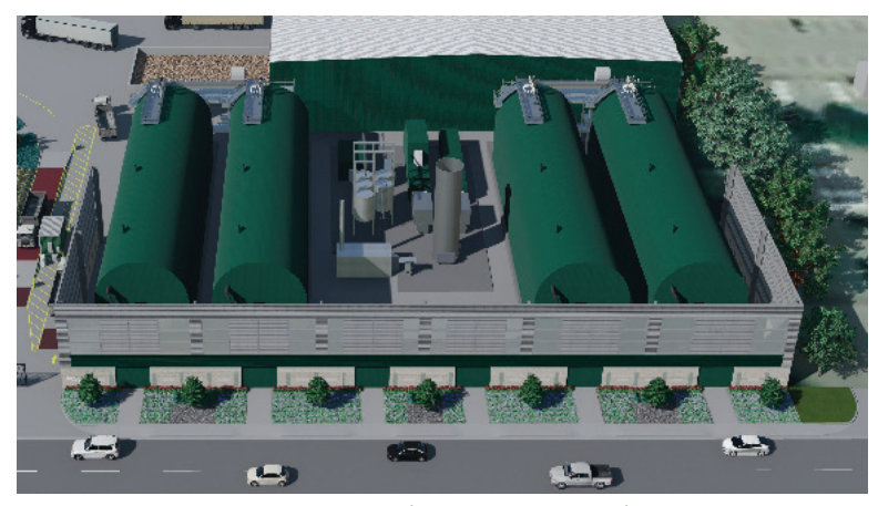
EDCO's Anaerobic Digestion Facility

With mandatory recycling deadlines on the horizon, the EDCO Anaerobic Digestion Facility will allow the City of Vista to meet compliance mandates, including AB 1826, AB 1594, and SB 1383, which are directly related to organic recycling in the State of California.